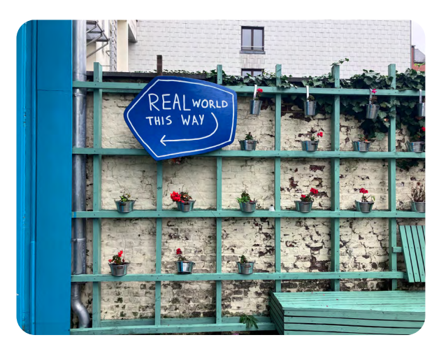
Elzenhof community centre. (2023).